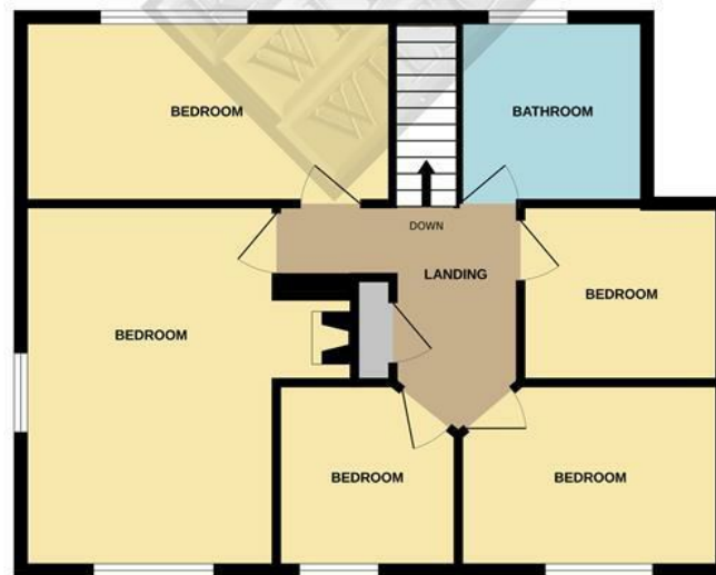
TOTAL FLOOR AREA: 1298 sq.ft. (120.5 sq.m.) approx.

Whilst every attempt has been made to ensure the accuracy of the floorplan contained here, measurements of doors, windows, rooms and any other items are approximate and no responsibility is taken for any error, omission or mis-statement. This plan is for illustrative purposes only and should be used as such by any prospective purchaser. The services, systems and appliances shown have not been tested and no guarantee as to their operability or efficiency can be given. Made with Metropix ©2024